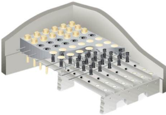
monolithic corrugated panel filter floor

Lightweight and easy to install yet extremely strong.