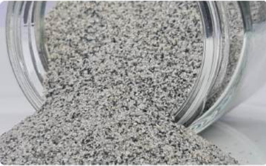
super fine sand, and perfect for artificial turf